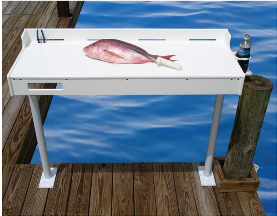
#DSTA-48 Permanently Mounted Dock Side Filet Table